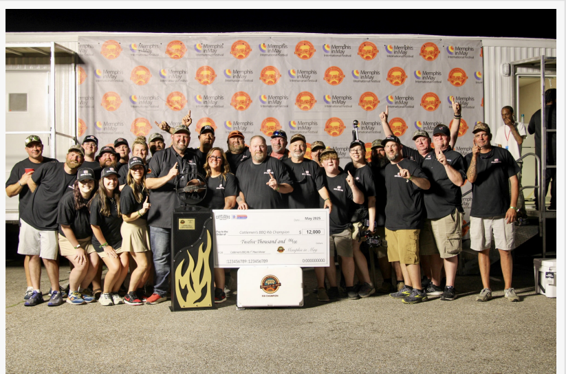
2025 WCBCC Grand Champion

Competition Teams interested in joining the 2026 competition can apply now at MemphisInMay.org . Spaces is limited, and early application is encouraged as the contest has the potential to sell out quickly.