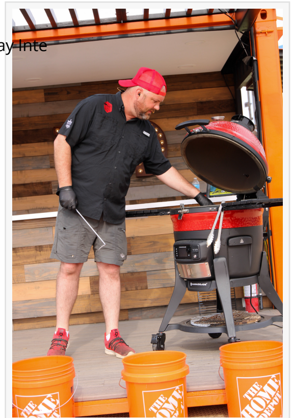
Home Depot Outdoor Kitchen at the 2025 World Championship Barbecue Cooking Contest

This press release can be viewed online at: https://www.einpresswire.com/article/864970349