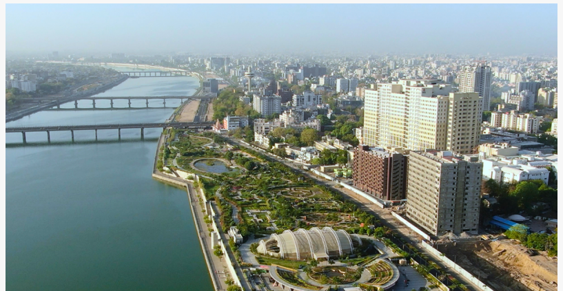
Ahmedabad Miva Real Estate Hosts Exclusive Property Showcase

With the Dubai Property Showcase in Ahmedabad, Miva Real Estate is bringing great property investment deals closer to Indian investors. If you're interested in investing in appealing property deals in the UAE, you must not miss this exclusive event. By attending this expo, you will be able to discover investment options and get expert advice that aligns with your financial goals.