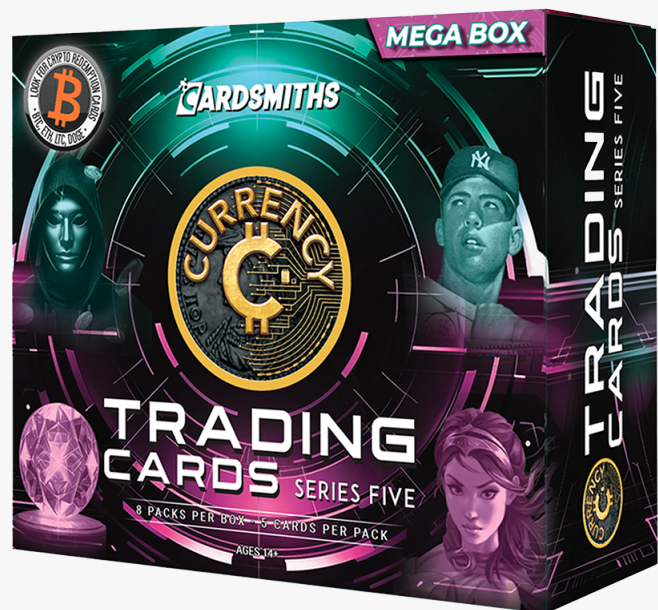
Currency Series 5 Mega Box

Collectors can uncover rare and dazzling variants such as parallel Holofoils, super-short prints, and exclusive Meta-Rare Refractor™ and Gemstone Refractor™ cards. Currency Series 5 also introduces the largest-ever offering of Cryptocurrency Redemption Cards in Cardsmiths' history,