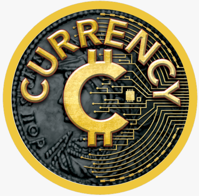
Currency Series Trading Cards by Cardsmiths

This press release can be viewed online at: https://www.einpresswire.com/article/865385180