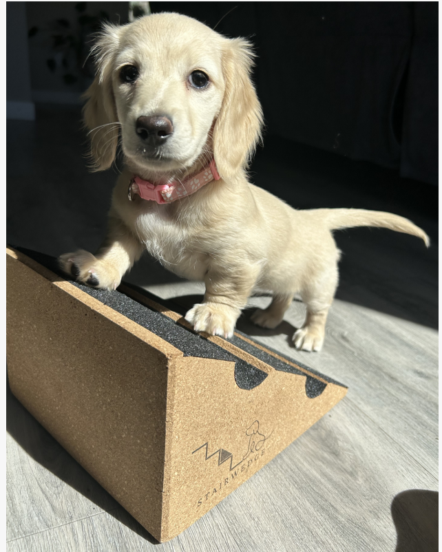
dog stair safety