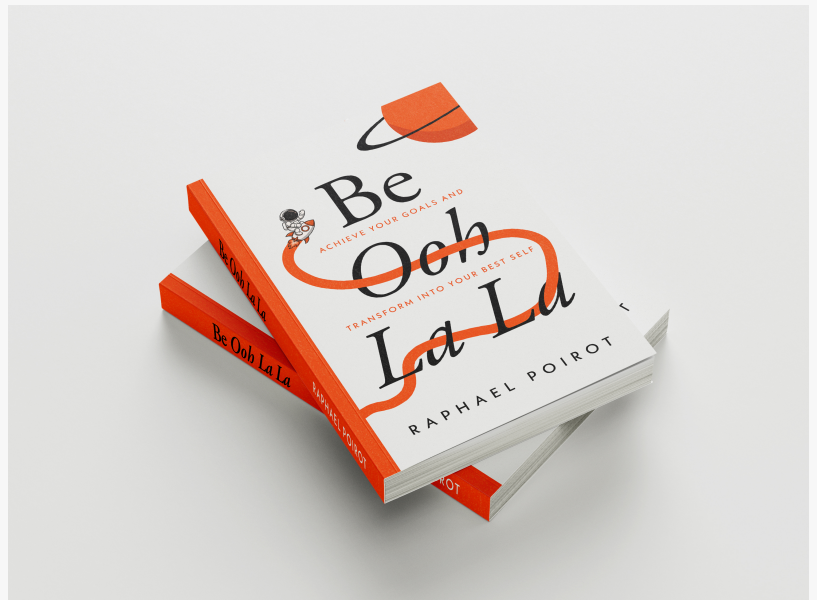
Be Ooh La La — a practical and inspiring guide to achieving your goals and transforming into your best self