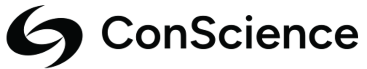
ConScience AB Logo

Because each configuration responds differently to environmental noise and setup imperfections, the QiB2 also serves as a powerful benchmarking tool for cryogenic microwave wiring, shielding, and filtering, as well as for the development and validation of control software and hardware. Whether you're establishing a new quantum lab, training students and researchers, or testing cryogenic setups, the QiB2 offers a robust and flexible foundation for experimentation and learning.