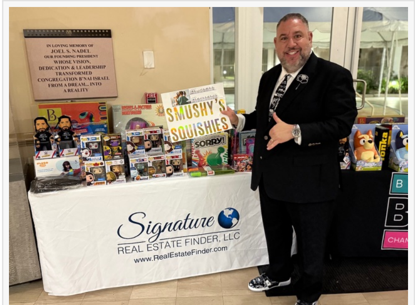
Some of the toys collected for Smushy's Squishies