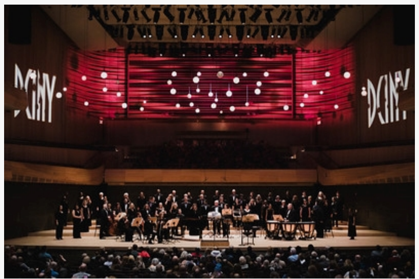
David Geffen Hall, Lincoln Center