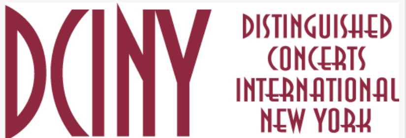
DCINY, a premiere concert production company