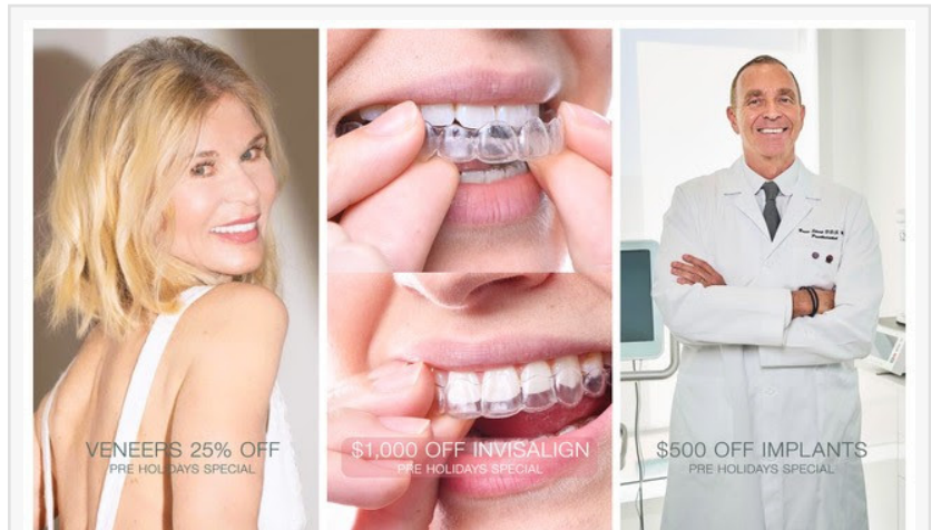
25% OFF Your Holiday Smile

□ This Miami dentist practice is offering 25% off porcelain veneers for plans confirmed on or before December 31, 2025—this veneer special offer in Miami keeps the full treatment workflow from assessment to placement.