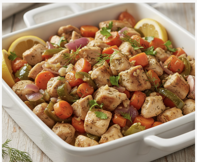
Demeter's Pantry's Lemon Garlic Chicken and Vegetables, a high-protein meal made from scratch with lean chicken, fresh herbs, and clean-label ingredients.

Among the high-protein offerings in foodservice is Demeter's Pantry's Lemon Garlic Chicken and Roasted Vegetables, which provides 20 grams of protein per serving. It is made from scratch with lean chicken, fresh herbs, and clean ingredients for a balanced diet. Under federal food labeling guidelines, these prepared meals qualify as high protein. Other protein-rich favorites include: Beef Enchiladas with Rice and Salsa Roja, Chicken Enchiladas with Rice and Salsa Verde from the brand's Hispanic-inspired line, Turkey Meatballs with Couscous in a Moroccan-inspired sauce,