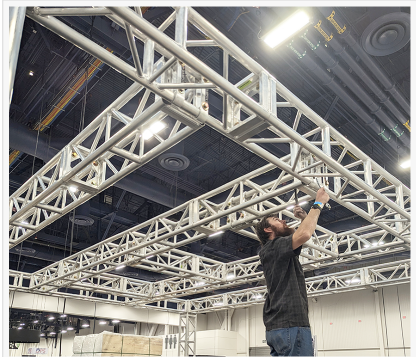
Smartstage setting up truss structures from local hardware inventory for a global brand activation client hosting an event in Las Vegas

This press release can be viewed online at: https://www.einpresswire.com/article/866974438