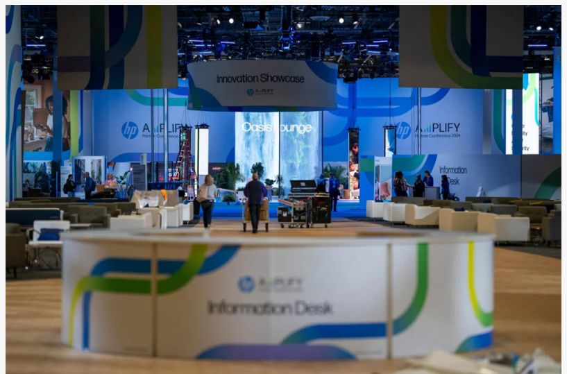
Hewlett Packard Amplify event staged by powerhouse design firm EMC3 with stage rental hardware by Smartstage

EINPresswire.com/ -- For HP and EMC3 's corporate activations in Las Vegas, Smartstage's local headquarters, warehouse, and staging support teams turned last-minute layout changes into same-day solutions. With inventory, trucks, and staging techs based just minutes from the Strip, Smartstage's Las Vegas stage rental solutions helps clients avoid compounding delays that can derail global brand events.