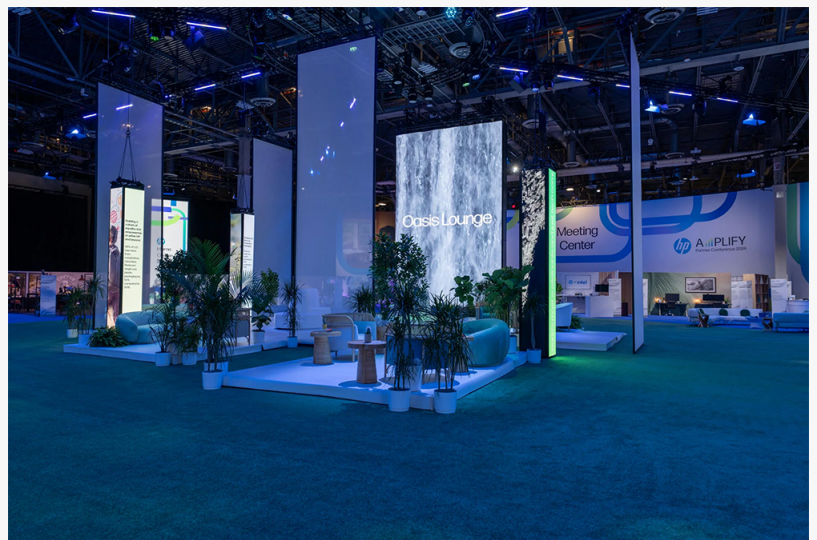
Latest corporate event booth and exhibit designs mastered by EMC3 design firm using Smartstage OTS hardware and custom fabrication capabilities for the HP Amplify partner event in Las Vegas, Nevada