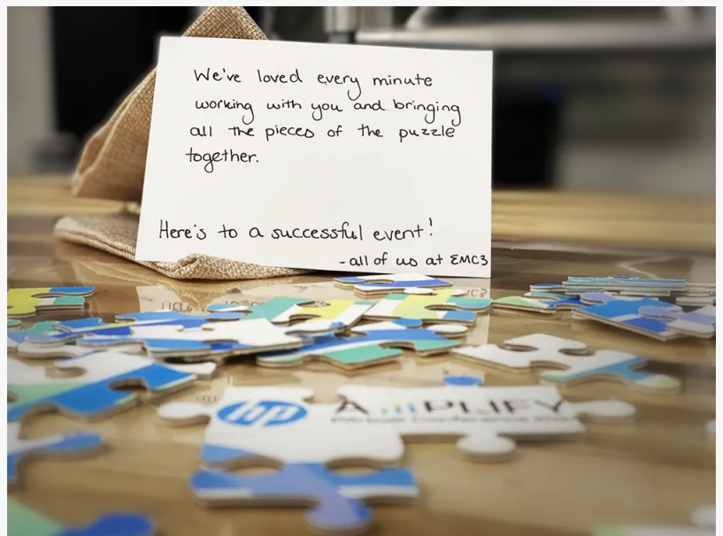
Another happy corporate brand activation client and review for Smartstage's stage rental capabilities in Las Vegas