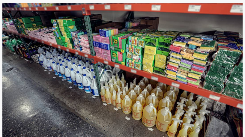
wholesale kitchen warehouse

The modern kitchen is not merely a space for cooking; it is a hub of creativity, efficiency, and presentation. Whether in a bustling restaurant or a private home, the tools and accessories that