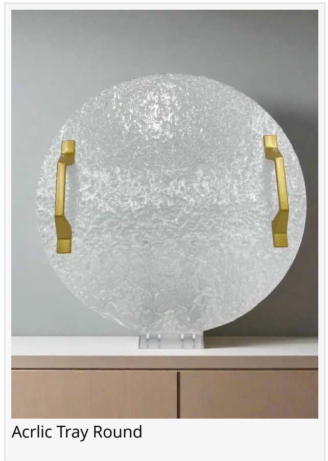
Acrylic Tray Round

□ Restaurant-grade cookware: Kitchen Depot's cookware collection includes high-performance pans, pots, and bakeware suitable for professional kitchens. The line emphasizes heat distribution, durability, and ease of maintenance, helping chefs and culinary teams maintain precision in cooking processes. Products in this category are sourced to deliver consistent