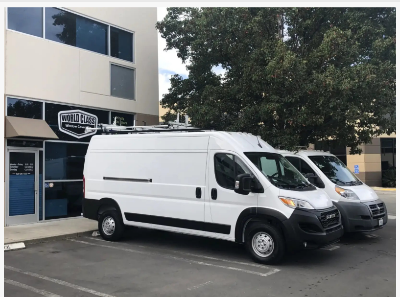
World Class Window Coverings Van

Dustin Yocum World Class Window Coverings +1 (925) 626-7333 email us here