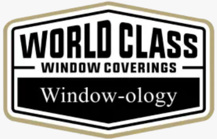
World Class Window Coverings Logo

PLEASANTON, CA, UNITED STATES, December 5, 2025 /EINPresswire.com/ -- World Class Window Coverings, a Pleasanton-based window treatment company serving Contra Costa County and surrounding areas, has launched a new website designed to make it easier for customers to explore, select, and schedule window covering services online.