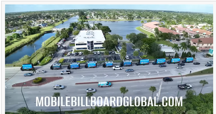
Mobile Billboard Global's nationwide fleet of digital LED billboard trucks delivering high-impact visibility in major U.S. markets.

Mobile Billboard Global was founded on the idea that advertising should meet audiences where they are—not the other way around. Traditional billboards rely on fixed placement and static visibility. Digital and static mobile billboard trucks, however, deliver targeted mobility, market-specific dominance, and immediate access to high-traffic areas. As a result, marketing agencies increasingly turn to Mobile Billboard Global as a core asset in outdoor advertising campaigns, especially as brands seek to bypass digital algorithm challenges and declining online engagement.