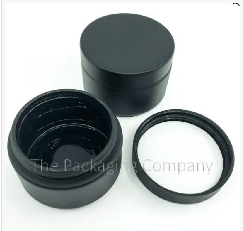
CR Glass Jar Design