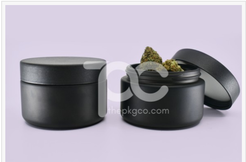
CR glass jar

The new showcase highlights the precision and durability of the CR glass jar, designed to ensure both product integrity and consumer protection. Built with compliance at its core, the packaging system follows stringent safety protocols to prevent unintended access while maintaining aesthetic value for shelf appeal. These jars are intended for brands seeking reliable