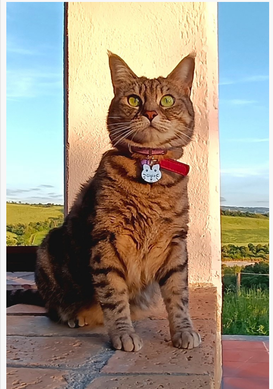
Gigia Travel Cat looking at the camera in Tuscany with green pastures behind her.