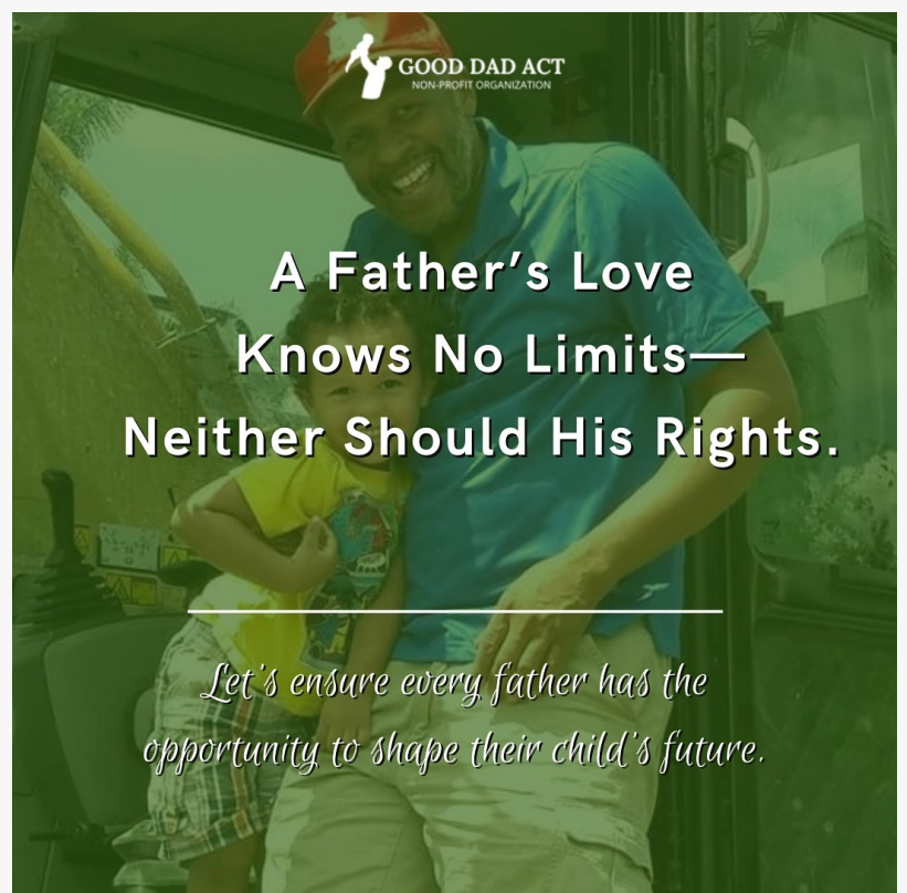
A fathers love knows no limits!