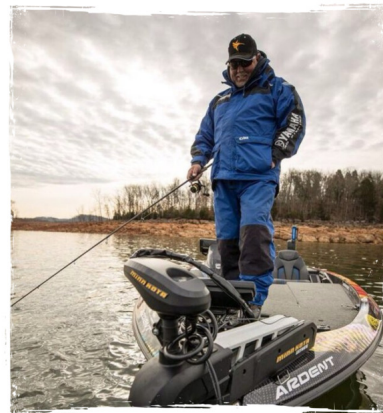
tackle loyalty program -