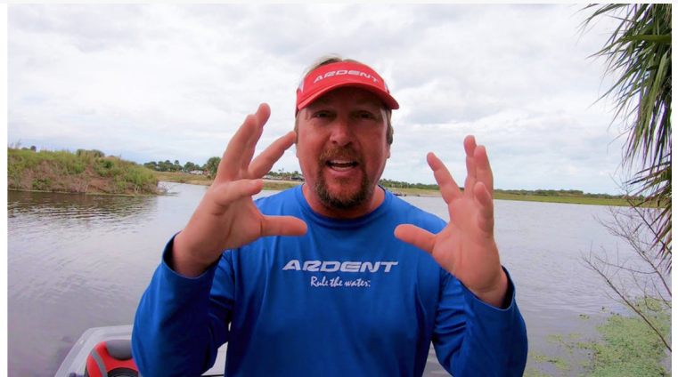
USA fishing discount membership -

This program helps make fishing more affordable and enjoyable for everyone.