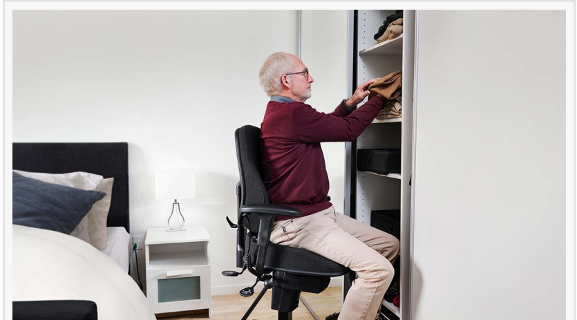
A VELA Chair helps seniors stay active, independent, and engaged in daily home activities.

TAMPA, FL, UNITED STATES, November 18, 2025 /EINPresswire.com/ -- As families across the United States prepare for the Thanksgiving holiday, hosts are focused on the perfect menu and festive décor. However, for the millions of Americans living with mobility disabilities, the thought of visiting a non-accessible home can be a source of stress.