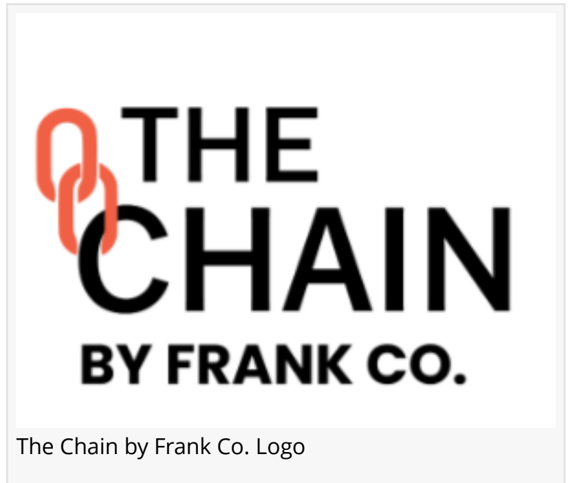
The Chain by Frank Co. Logo

Our team uploads Rat & Boa's product information directly into the platform, where AI processes and organises the data automatically. Suppliers simply upload their audit reports and supporting