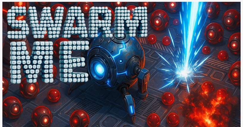
Swarm Me by KBGS

testing, the playtest offers a snapshot of a growing and evolving system.