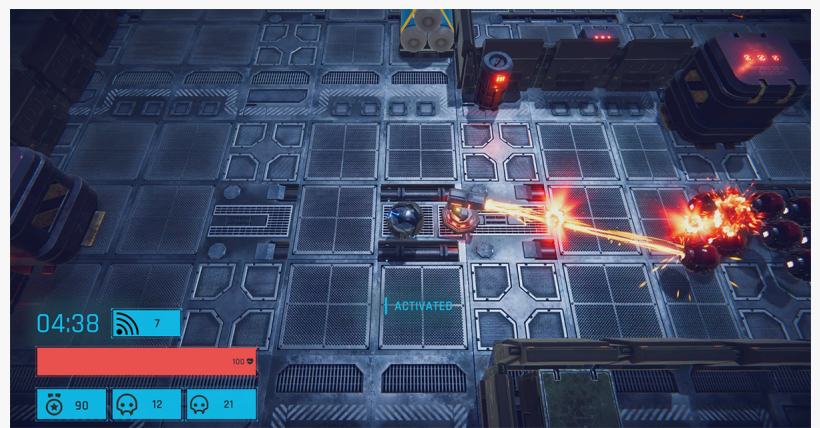
Swarm Me gameplay screenshot from current build