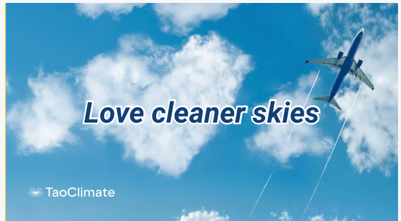
Tao Climate - Love cleaner skies