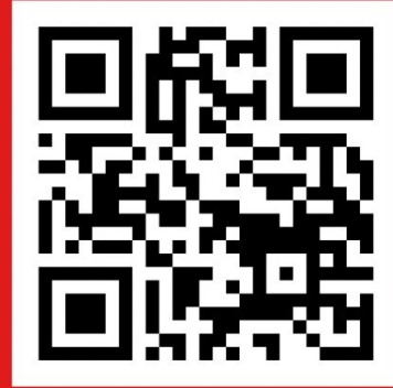
Nobody Move App QR Code

This press release can be viewed online at: https://www.einpresswire.com/article/868933850