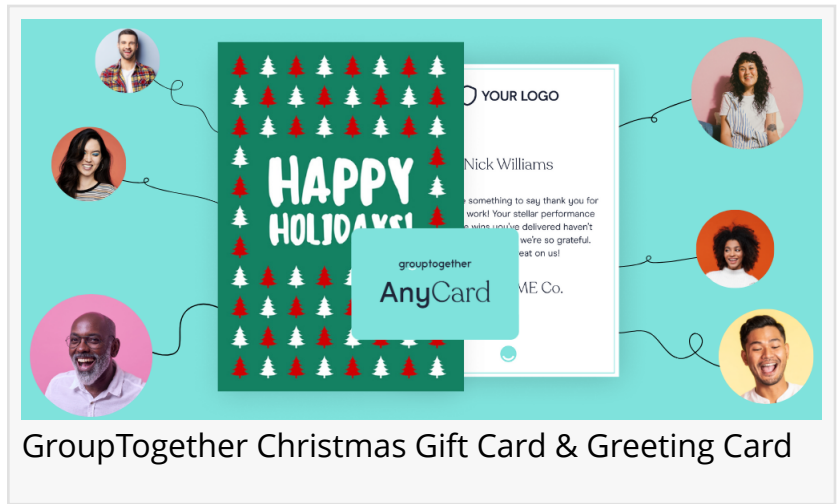
GroupTogether Christmas Gift Card & Greeting Card