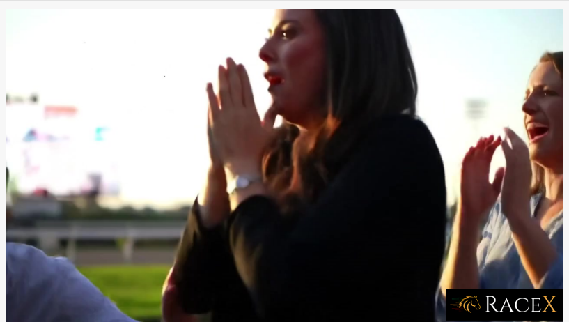
The Joy of Winning Starts with RaceX

Syndicate ownership has become increasingly common in major racing jurisdictions such as Australia, the UK, and Japan. RaceX seeks to align Dubai with these international models by establishing a system rooted in transparency, communication, and accessibility, while still