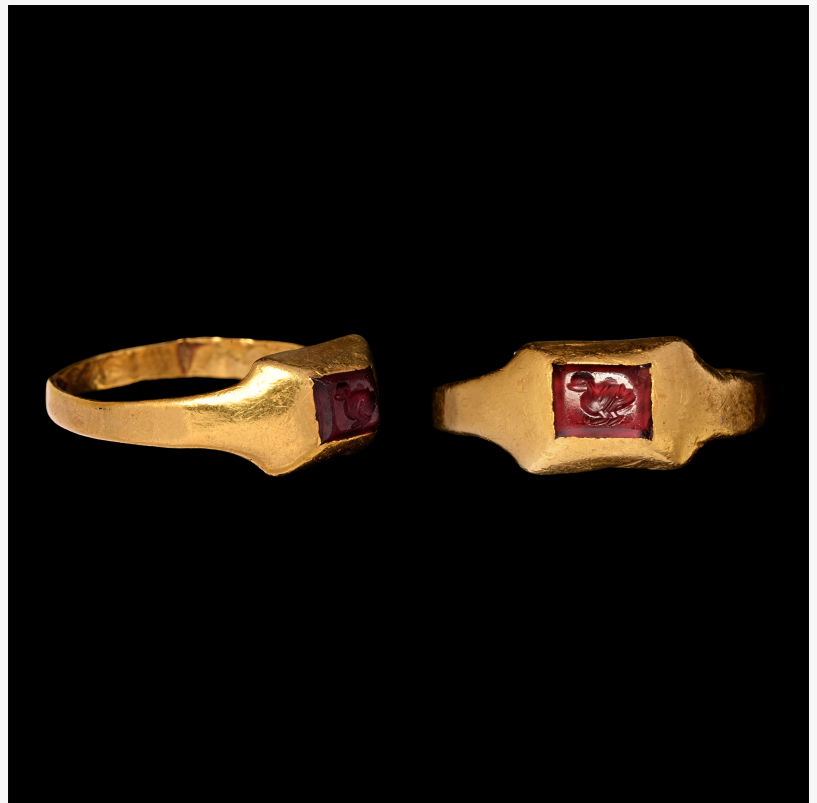
Romano Egyptian gold ring with garnet intaglio depicting a duck, 1st century B.C. to 1st century A.D. Estimate: £3,000-£4,000 ($4,020-$5,360)