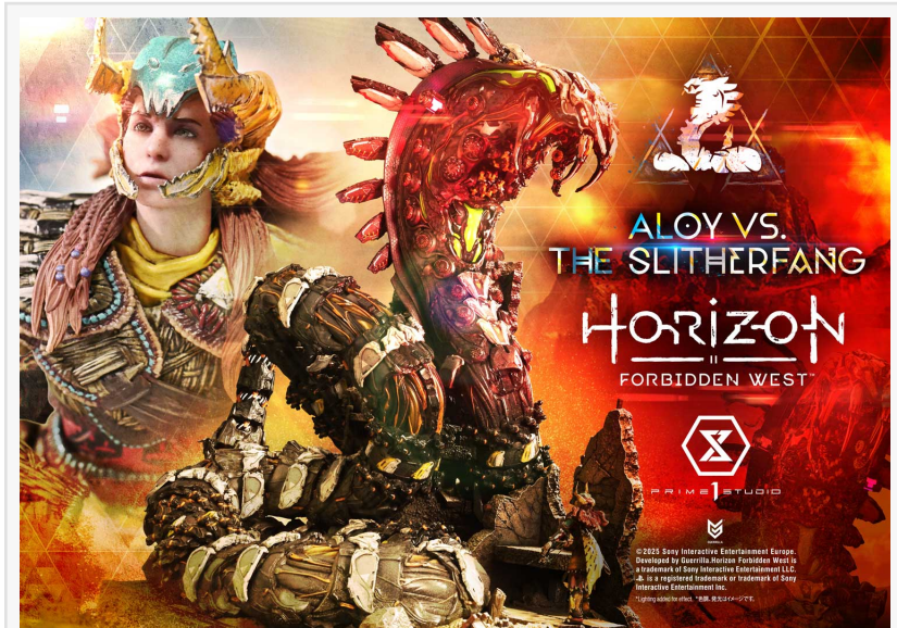
Ultimate Diorama Masterline Horizon Forbidden West Aloy vs. The Slitherfang

Aloy is sculpted with fine detail in her facial expression, outfit, and equipment, including her Death-Seeker's Shadow and Tenakth Vanquisher gear. The pose shows her drawing her bow, with braided hair flowing to match the