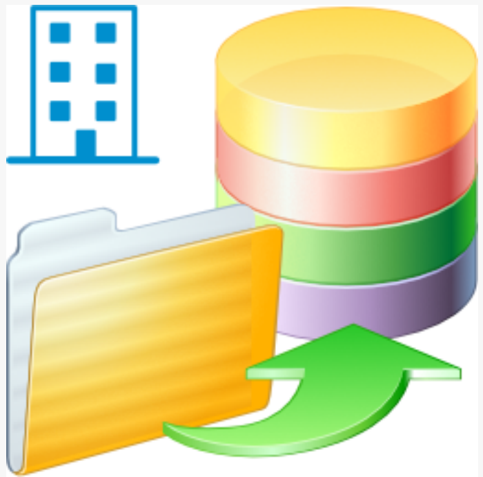
FmPro Migrator Site License Edition Icon 256 x 256

* New Output Programming Languages: The software now supports conversion to VBA for Excel and VBA for Word.