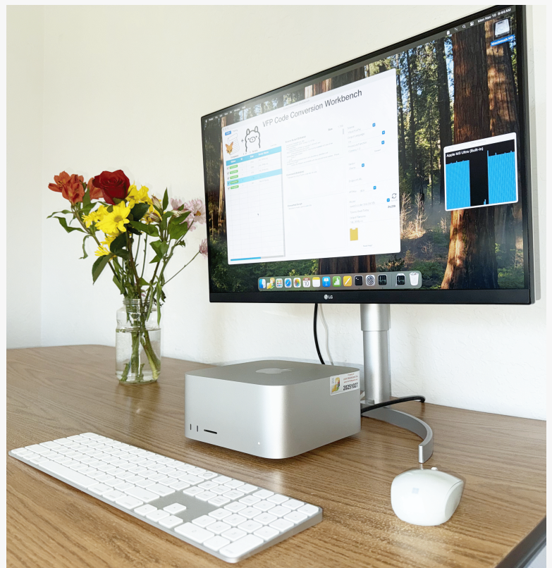
FmPro Migrator Site License Edition Server Photo