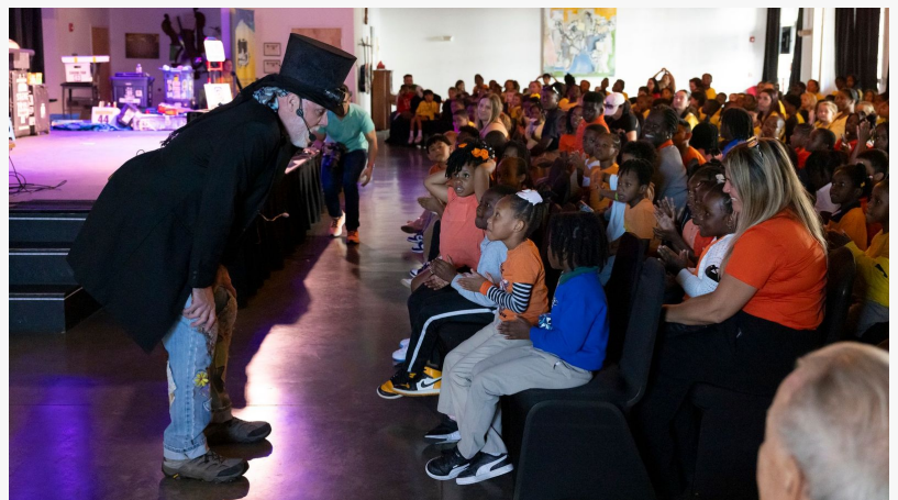
Arts Garage Opens 2025-2026 Kimmel Family Series