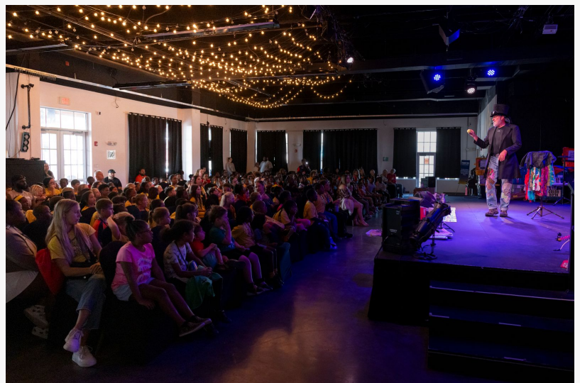
Arts Garage Opens 2025-2026 Kimmel Family Series

Now in its second year, The Kimmel Family Series at Arts Garage brings world-class arts education programming to local students across Palm Beach County—free of charge—through partnerships with local schools. The series highlights performances that blend learning with entertainment, making the arts accessible to all and sparking lifelong creativity in young audiences.