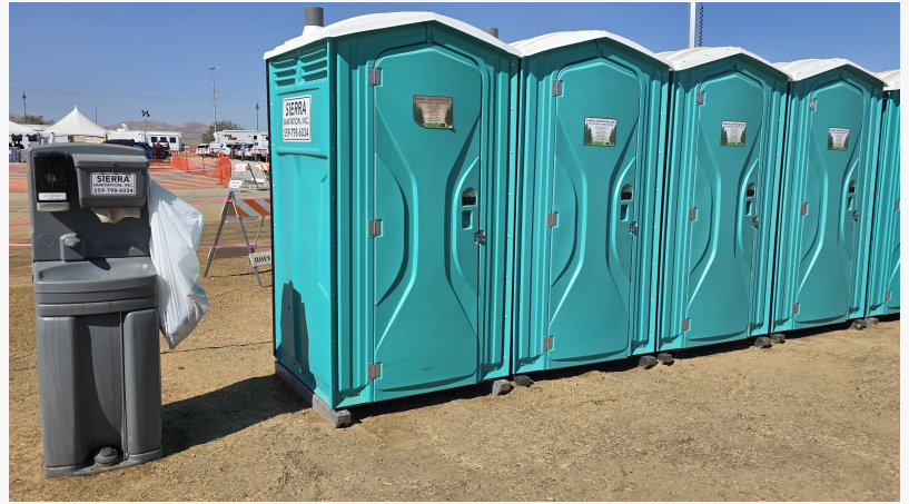
A Sierra Sanitation portable restroom ready for deployment across Central Valley job sites and events.