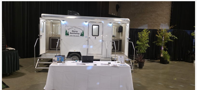
A Sierra Sanitation luxury restroom trailer providing upscale comfort for events and special occasions