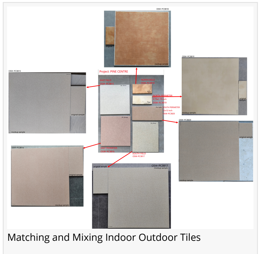
Matching and Mixing Indoor Outdoor Tiles