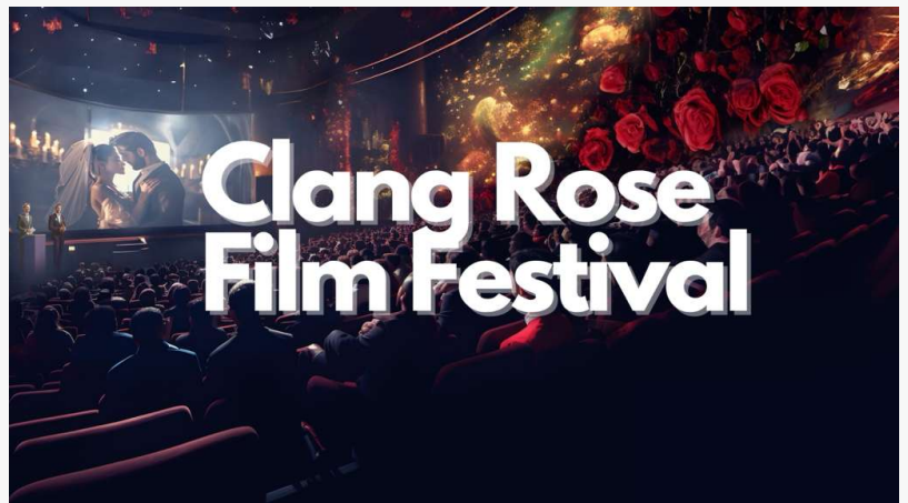
Clangrose Film Festival 2026

"The Signature" follows couples through the pivotal moments that define married life—from buying a home and navigating career sacrifices to managing family conflicts, making critical financial decisions, raising children, and negotiating cultural compromises. Each "signature" in