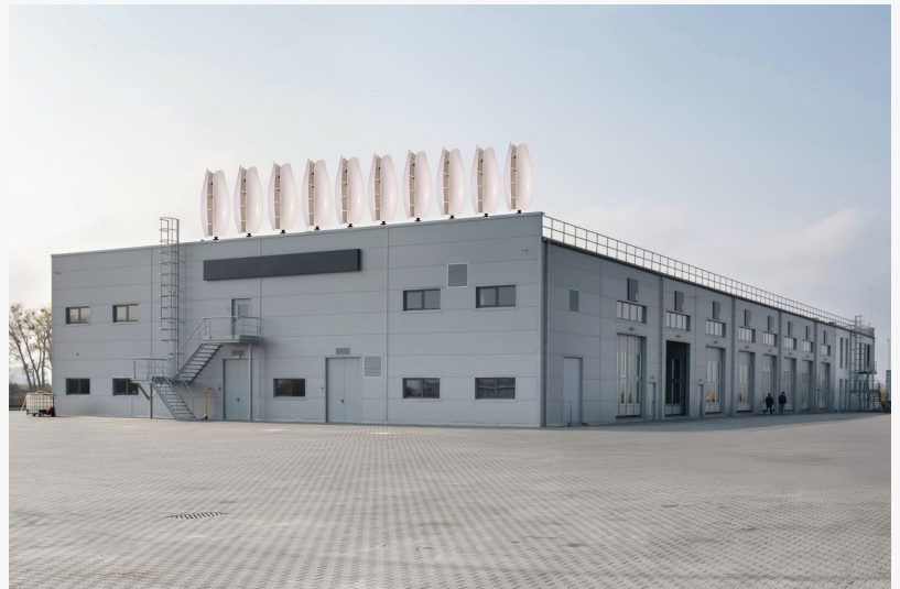
Row of wind turbines on roof

A presentation for commercial customers can be found at https://d528cc30-602d-4d22-97c0-