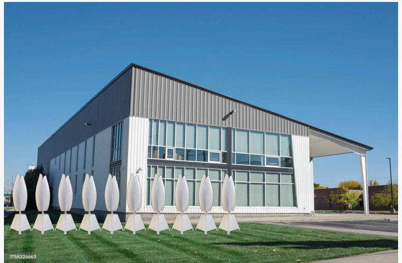
Flower Turbines on ground level

Flower Turbines makes small wind turbines that are special in many ways. One of the game-changing innovations of great interest for data centers is their patented "cluster" or "bouquet" effect; when placed close together properly, each one added to a group makes the whole group perform better. As few as 4 turbines together produce the electricity of 8 separate turbines. This gives data centers and businesses of all kinds cost and space effectiveness greater than alternatives.