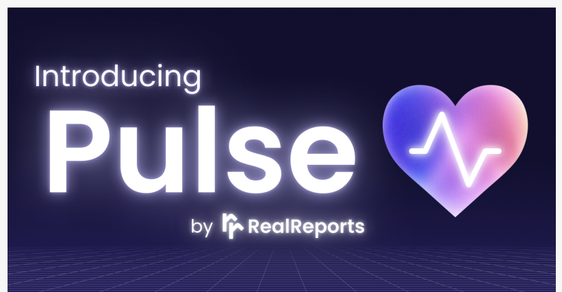
RealReports Introduces Pulse: AI-Driven Client Retention Engine for Real Estate Agents

Because Pulse is directly integrated into the RealReports ecosystem, it offers far more than