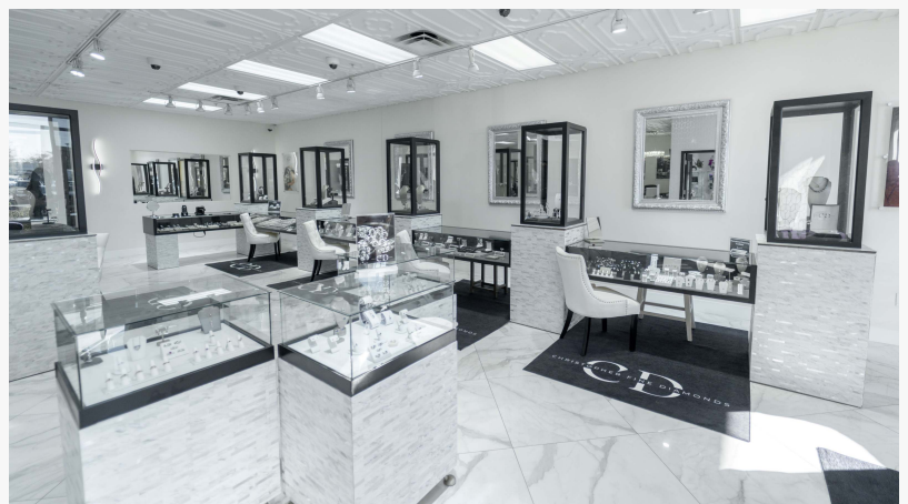
Christopher Fine Diamonds – In-Person CAD Jewelry Design, Chandler AZ