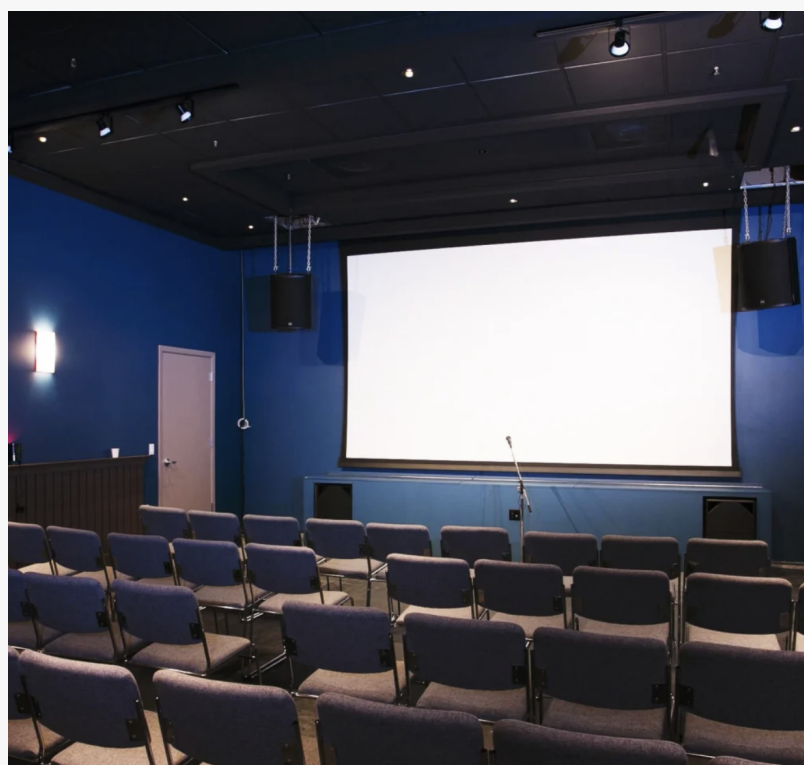
Seed&Spark Rental Space Wish List