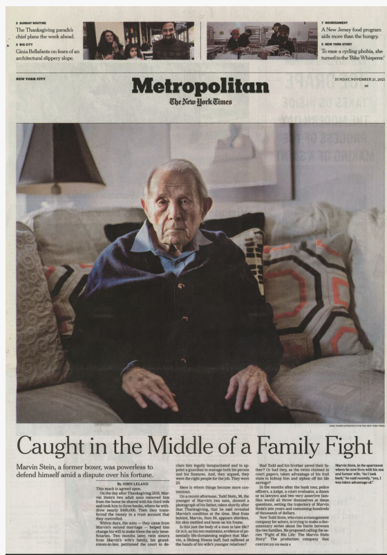
New York Times Cover