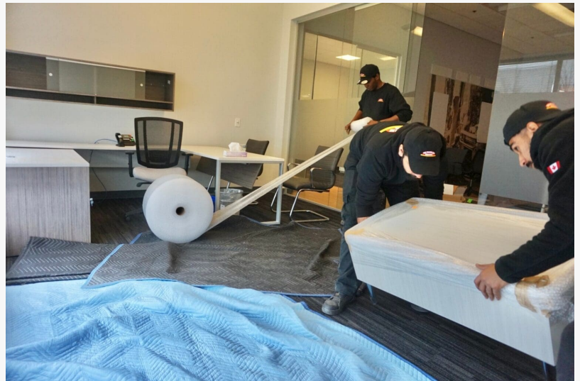
Professional Packing Services

No Problem Movers integrates operational protocols designed to ensure efficiency and safety in every relocation project. Trained personnel follow systematic procedures for packing, loading, and transporting goods, reducing the likelihood of damage and delays. The