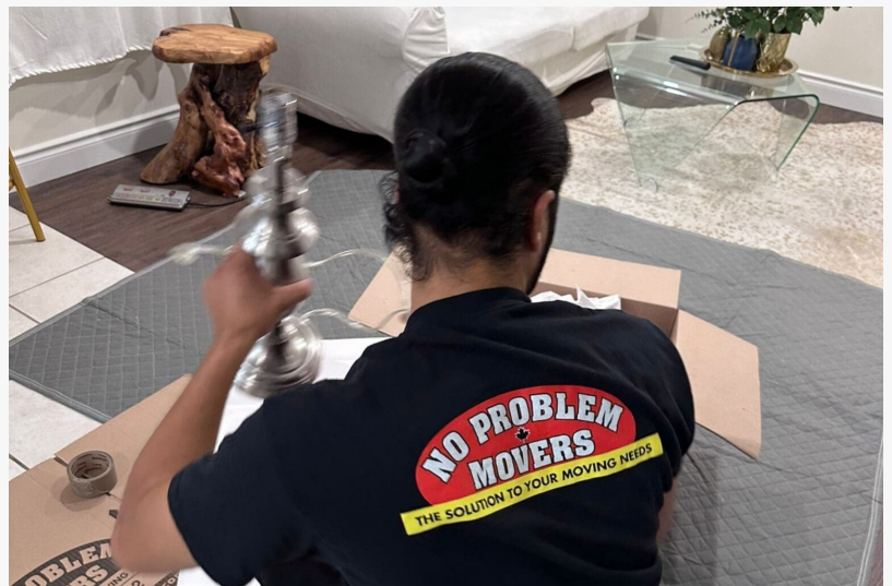
Movers in Ajax

Residential moving services include packing, loading, transportation, and unloading of household goods. Specialized moving options accommodate items such as pianos, fine art, and fragile equipment, reflecting an attention to detail required in professional relocation projects.