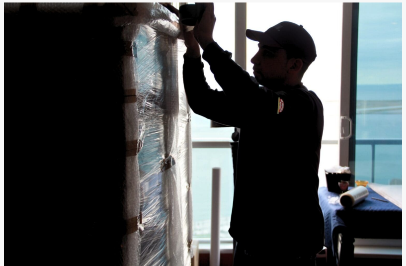
residential moving services