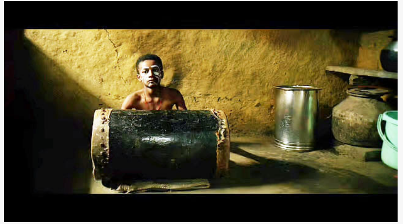
Still from "Rhythm of Dammam" by Jayan Cherian

This press release can be viewed online at: https://www.einpresswire.com/article/872222734