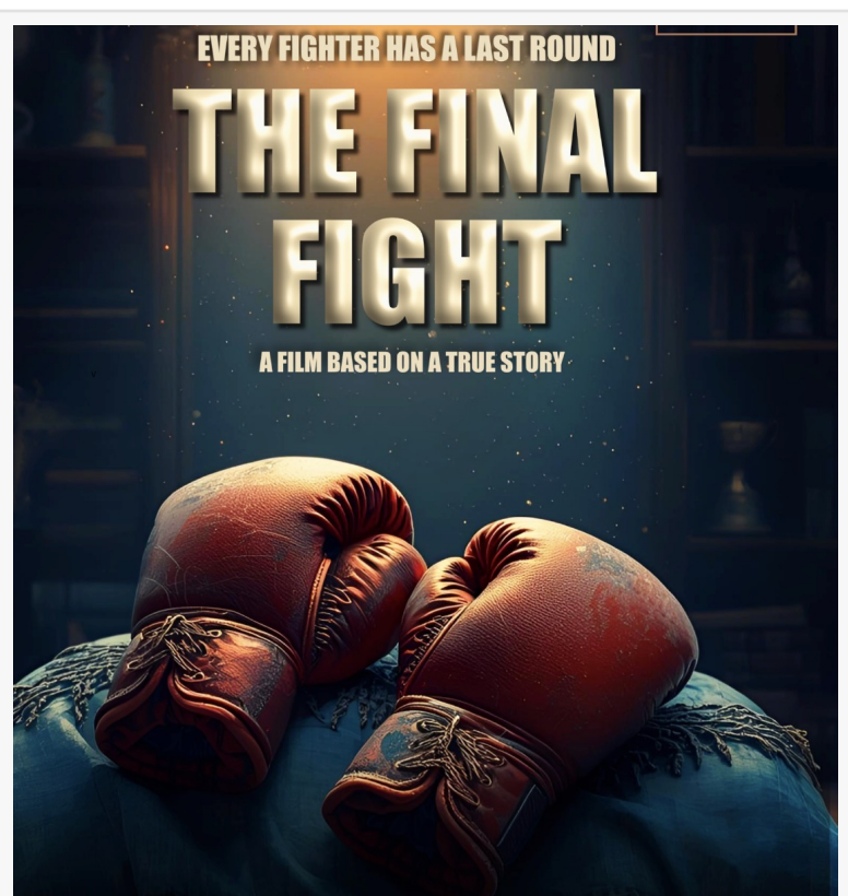
The Final Fight Investor Image