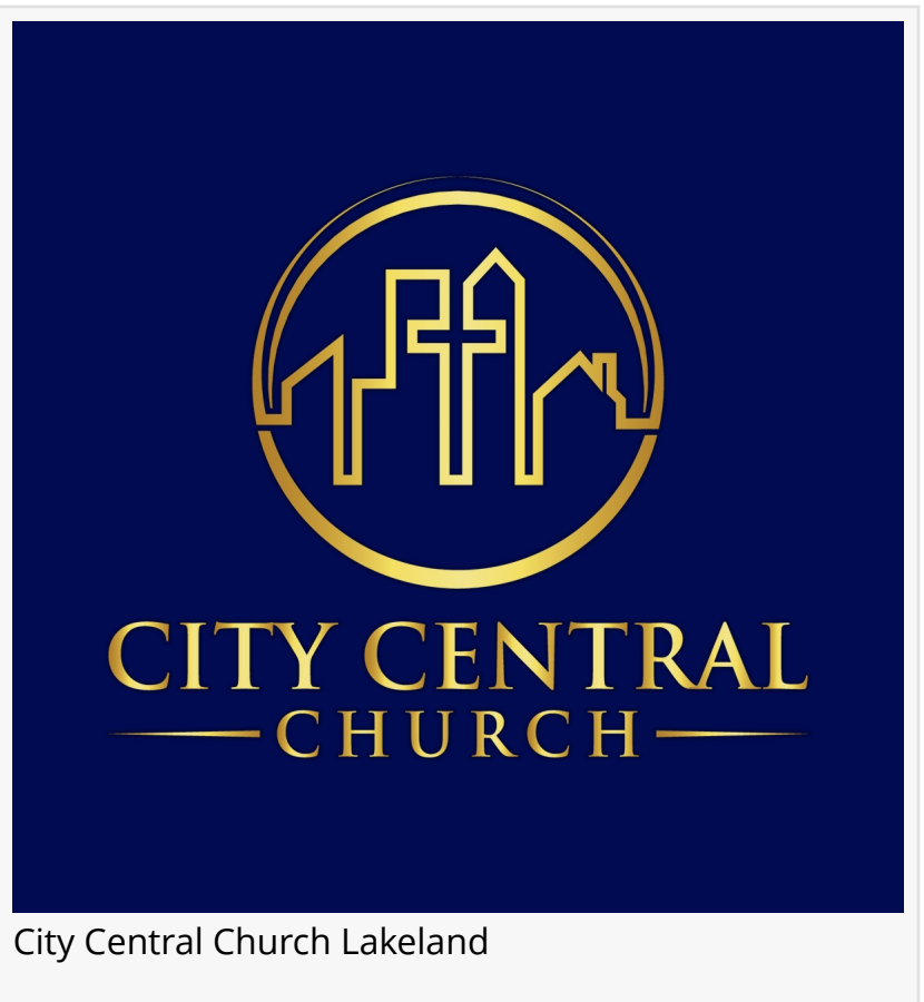
City Central Church Lakeland

Removing Barriers: Comfort in the Cold - Organizers are acutely aware of the logistical challenges of hosting an outdoor water event in December, even in Florida. To ensure that physical discomfort does not stand in the way of a spiritual decision, the church has announced a significant investment in attendee comfort: Every baptism pool utilized for the event will be fully heated.