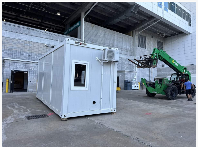
Portable office containers