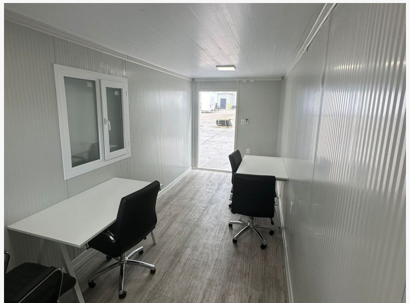
Container office design