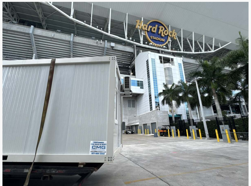
Modular office containers

Get a Fast Quote for Your Custom Modular Office