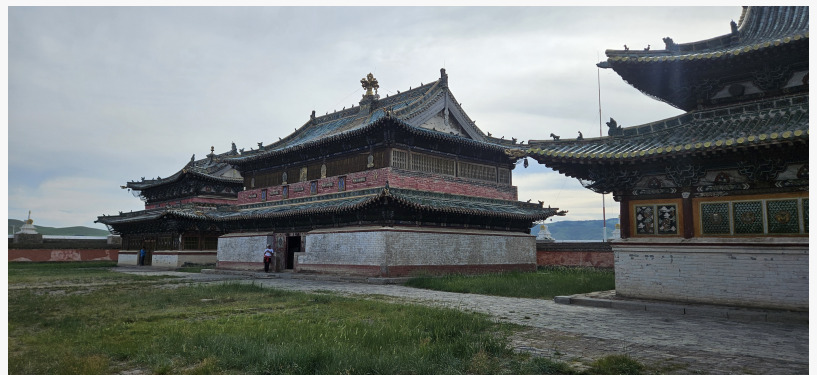
Where history meets nature: Mongolia is rich in stunning places