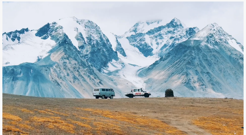
Drive through Mongolia's stunning landscapes