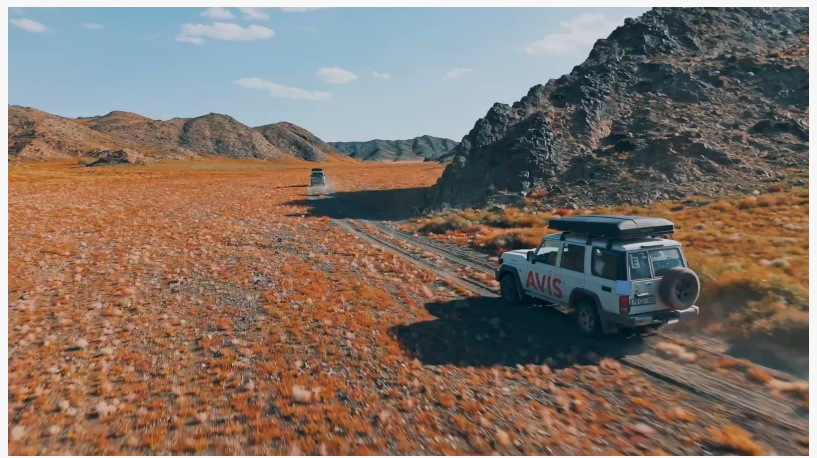
Mongolia's 4x4 self-drive tours offer amazing views

Throughout the year, Explorer.Company offers curated trips - in summer, they lead to every corner of the country, each more diverse than the next. What unites them is the vastness,