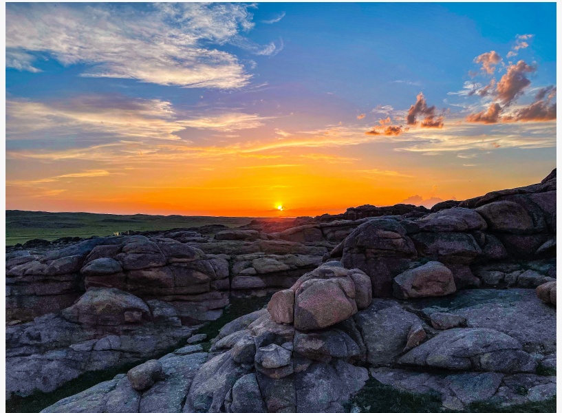
Mongolia's stunning landscapes are beyond impressive.

horseback riding, archery, and more. Bökh blends centuries-old techniques with ritual, precision, and raw strength - values reflected in the team's second-place finish. Alongside Orkhonbayar, the Mongolian team includes athletes from MMA, circus arts, and volleyball backgrounds. This mix of