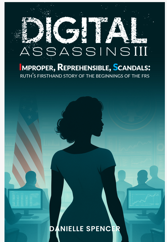
Digital Assassins III Book Cover