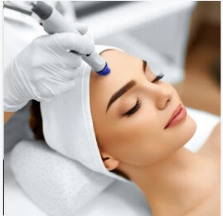
Medical Esthetics (Invasive & Non-Invasive)