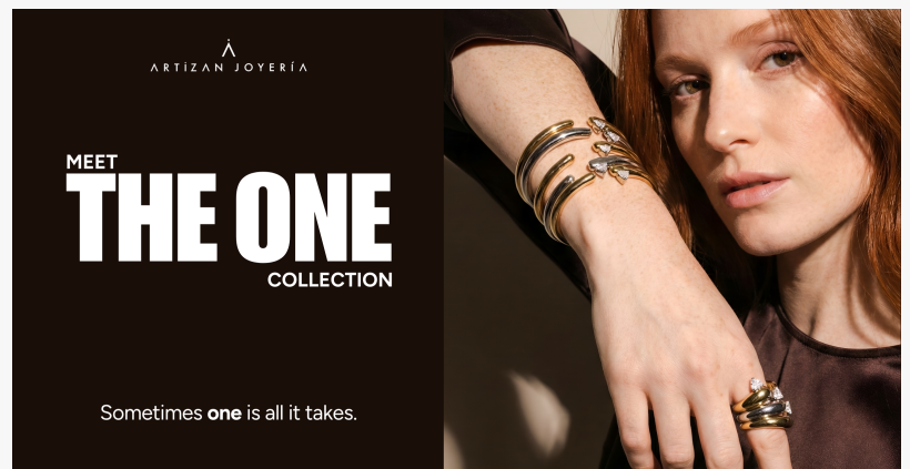
The One Banner 2