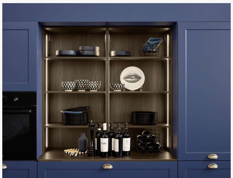
The new RAVENNA LACK frame front combines a classic country house look with modern value.

One of the most common complaints Akseuar Design hears from new clients is that their existing cabinets feel cheap long before they should. Doors stop aligning. Drawers feel loose. Shelves bow under the weight of dishes and pantry items. The kitchen looks older than the home itself.