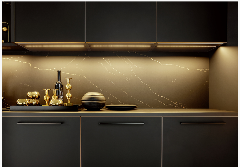
Matte elegance with brass edge and Anti-Fingerprint 2.0

ALEXANDRIA, VA, UNITED STATES, December 5, 2025 /EINPresswire.com/ -- Aksesuar Design, a luxury kitchen , bath and closet design studio in Alexandria, is publicly challenging what it calls “fake luxury” in home remodeling. The studio is introducing a clear alternative for homeowners across Washington DC, Maryland, Virginia and New York who are tired of glossy but disappointing renovations and want real luxury that combines taste, quality and everyday comfort.