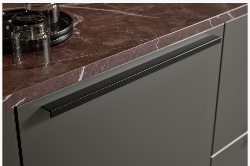
PEARL comes in the color Umbral metallic, combined with the expressive worktop decor Red Marble, which is also used in the niche and shelves.

Aksesuar Design has met many clients who visited several showrooms and saw the same trendy elements repeated again and again. They liked the drama in pictures but knew that their real weekday evenings involve cooking, homework, laptops, grocery bags and quick meals. They