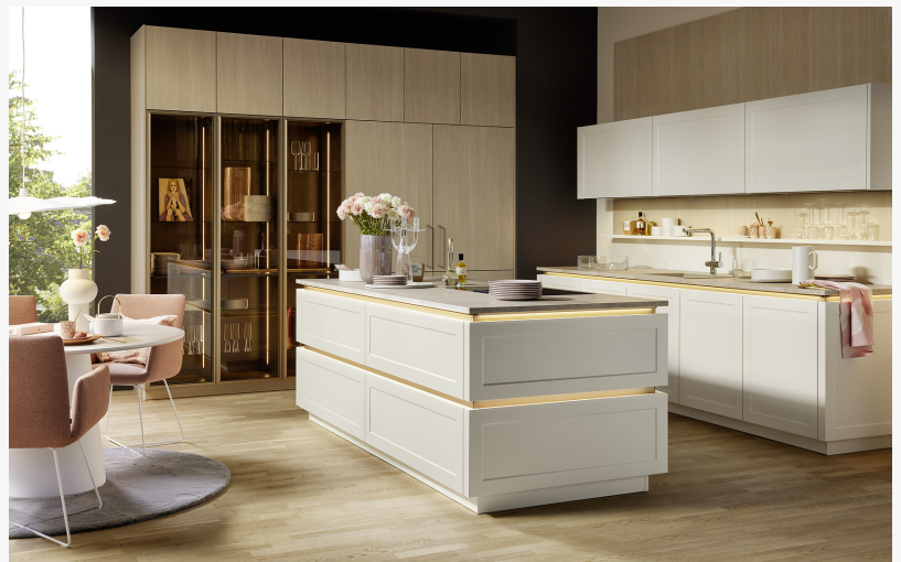
Ravenna Lack - Magnolia Softmatt