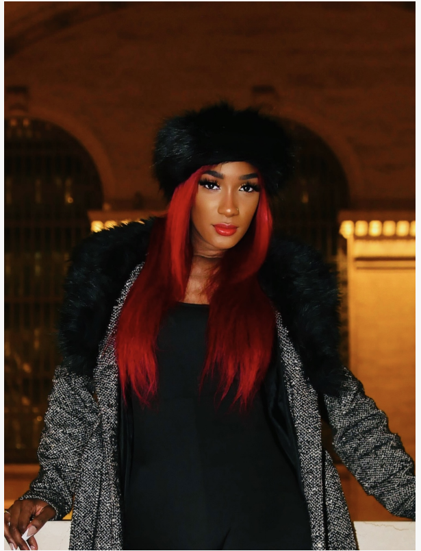
Ms. Camille at Grand Central NYC

This press release can be viewed online at: https://www.einpresswire.com/article/872687105