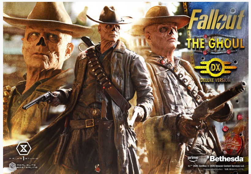
Real Elite Masterline Fallout (TV Series) The Ghoul

The base is designed to reflect his outlaw life in the Wasteland, incorporating Dogmeat standing close at his side, a weathered Nuka-Cola