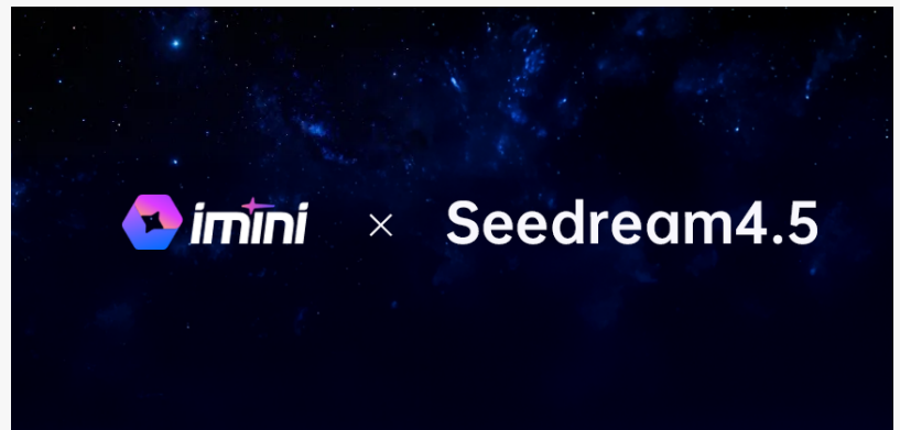
iMini AI integrates Seedream 4.5