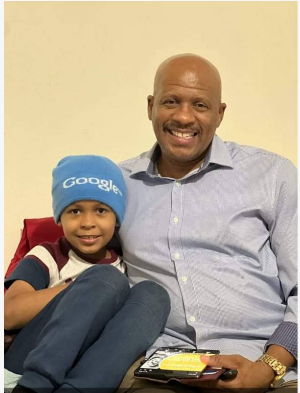
Fathers right should not be overlooked

Kentucky's Revised Statutes Chapter 406 outline how paternity may be established through voluntary acknowledgment, affidavit, court action, or genetic testing. Upon legal confirmation of paternity, fathers become liable for: